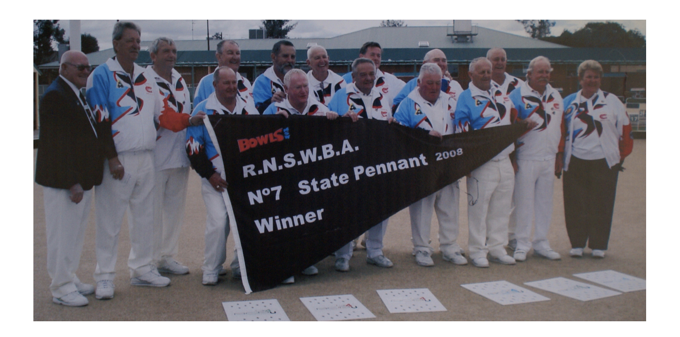
2008 - Grade 7 State Pennant Winners - Windang

The last time Windang won a State Pennant Winners Flag.