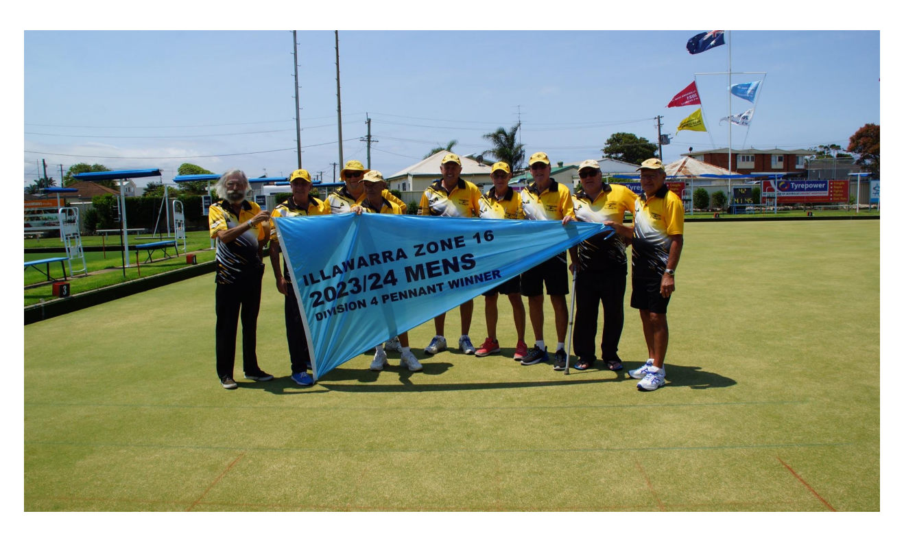
Men's Division 4 Pennant Winners - Fairy Meadow