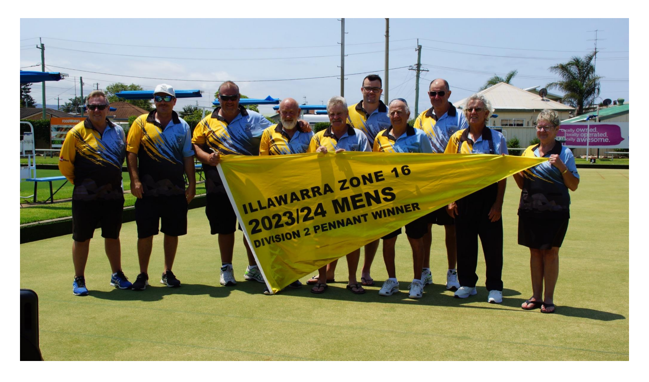
Men's Division 2 Pennant Winners - Towradgi

All results can be found on the Zone 16 website .