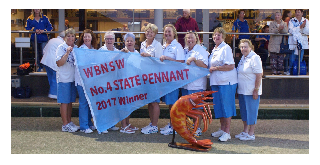
2017 - No 4 State Pennant Winners - Windang