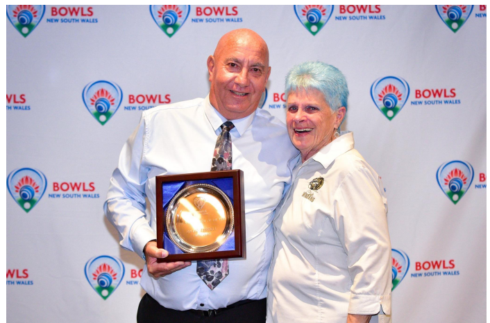
One happy couple!