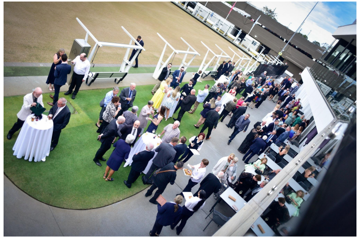
Canapés by the green