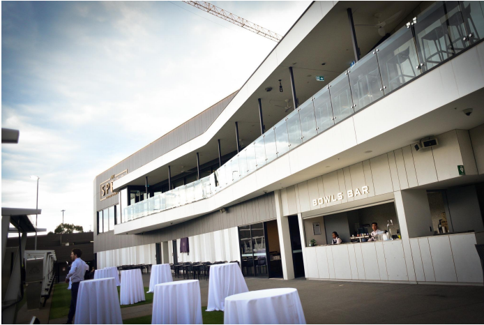
The bowls bar at Cabra Vale Diggers. We have got to get one of these!