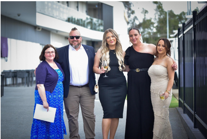
Some of our hard working Bowls NSW staff