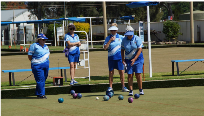
Deep in thought!