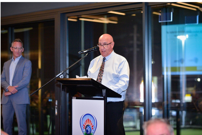
Thank you very much!