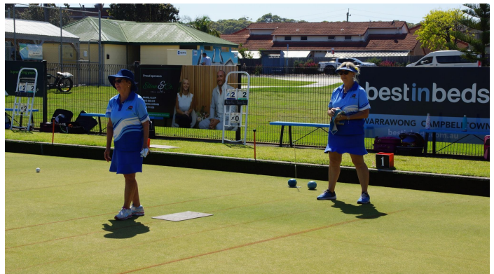
Two focused skips!