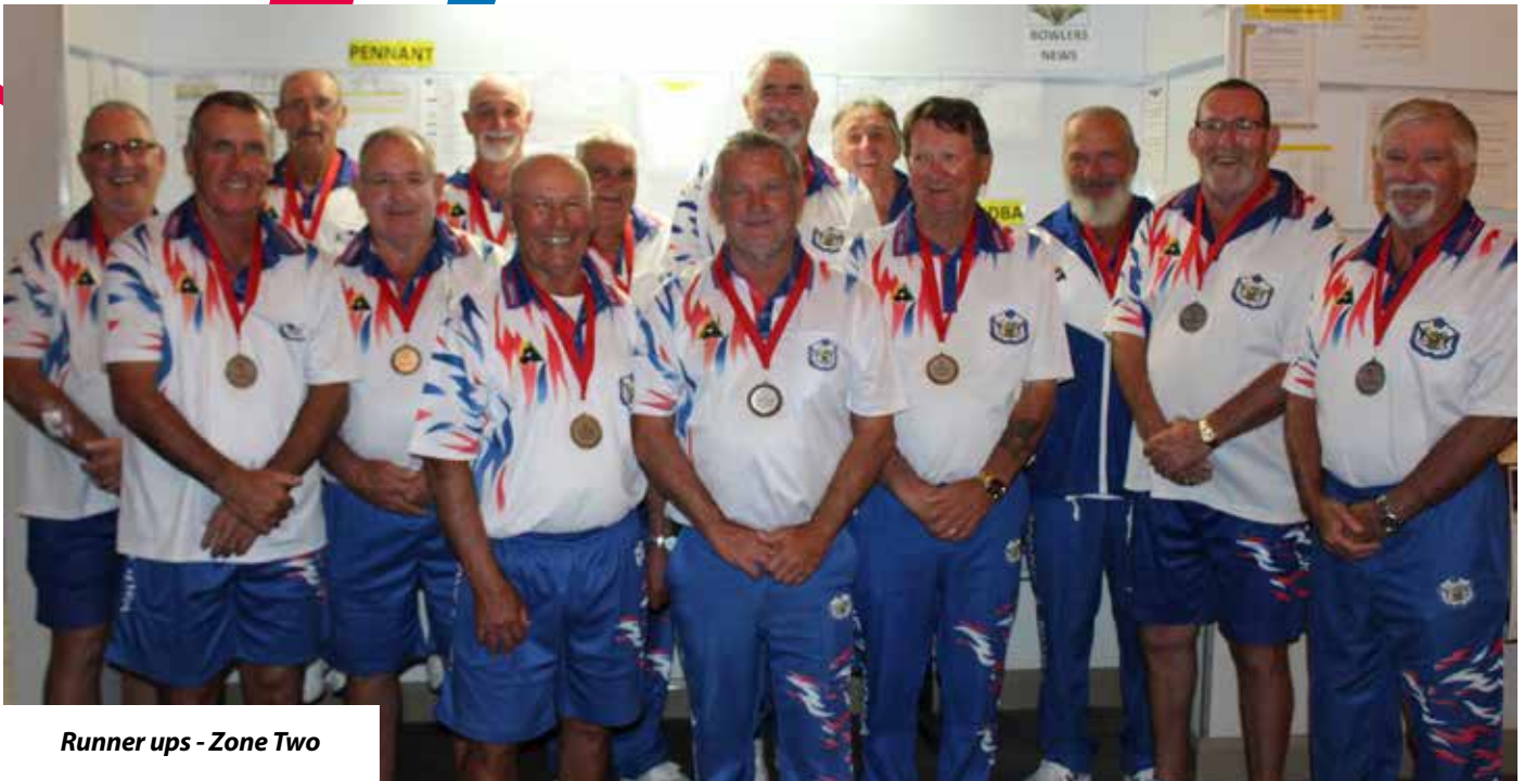
Runner ups - Zone Two

(Cont.) 11-shot victory over Rick Malley 27-16.